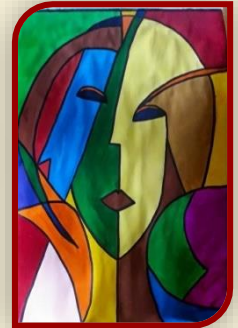
Chesana Agarwal, X C