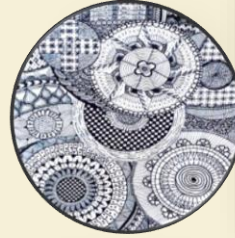
Chesana Agarwal X C