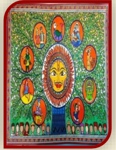
Dishita Agarwal X B